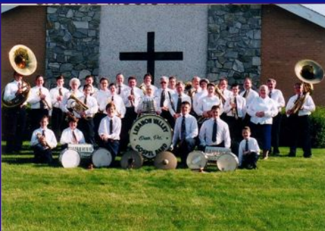
Lebanon Valley Gospel Band Sunday, June 13, 5:45pm

Friday evening after the service, will be our 5th annual hotdog and marshmallow roast.